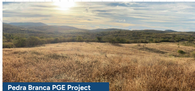
Pedra Branca PGE Project