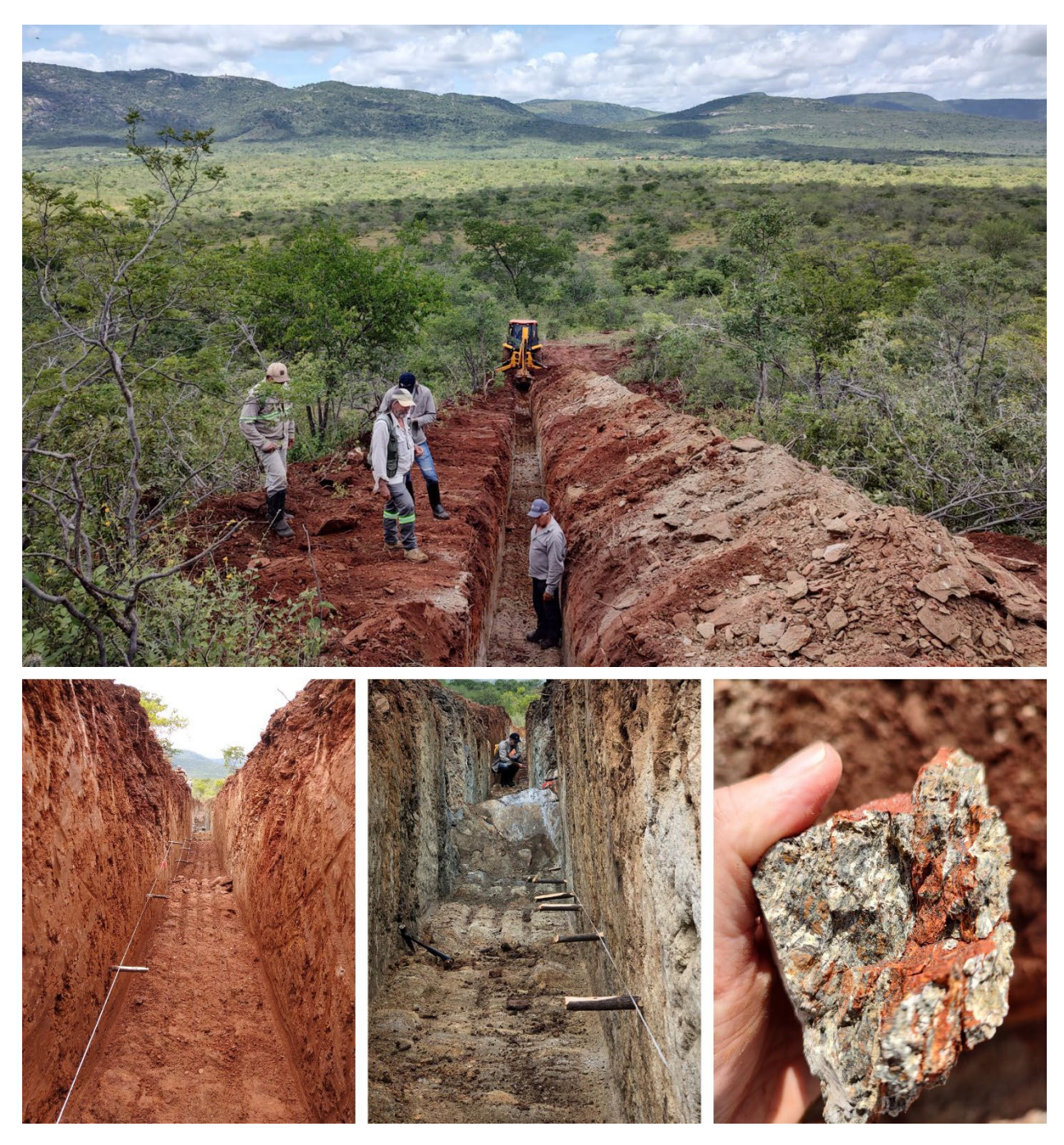
Figure 2: Photographs of trench TR22TR01 at Tróia target (top picture, looking east), with trench wall sampling intervals (bottom center and bottom left pictures) and a sample of chromitite-rich ultramafic rock submitted for PGE assay (bottom right picture).