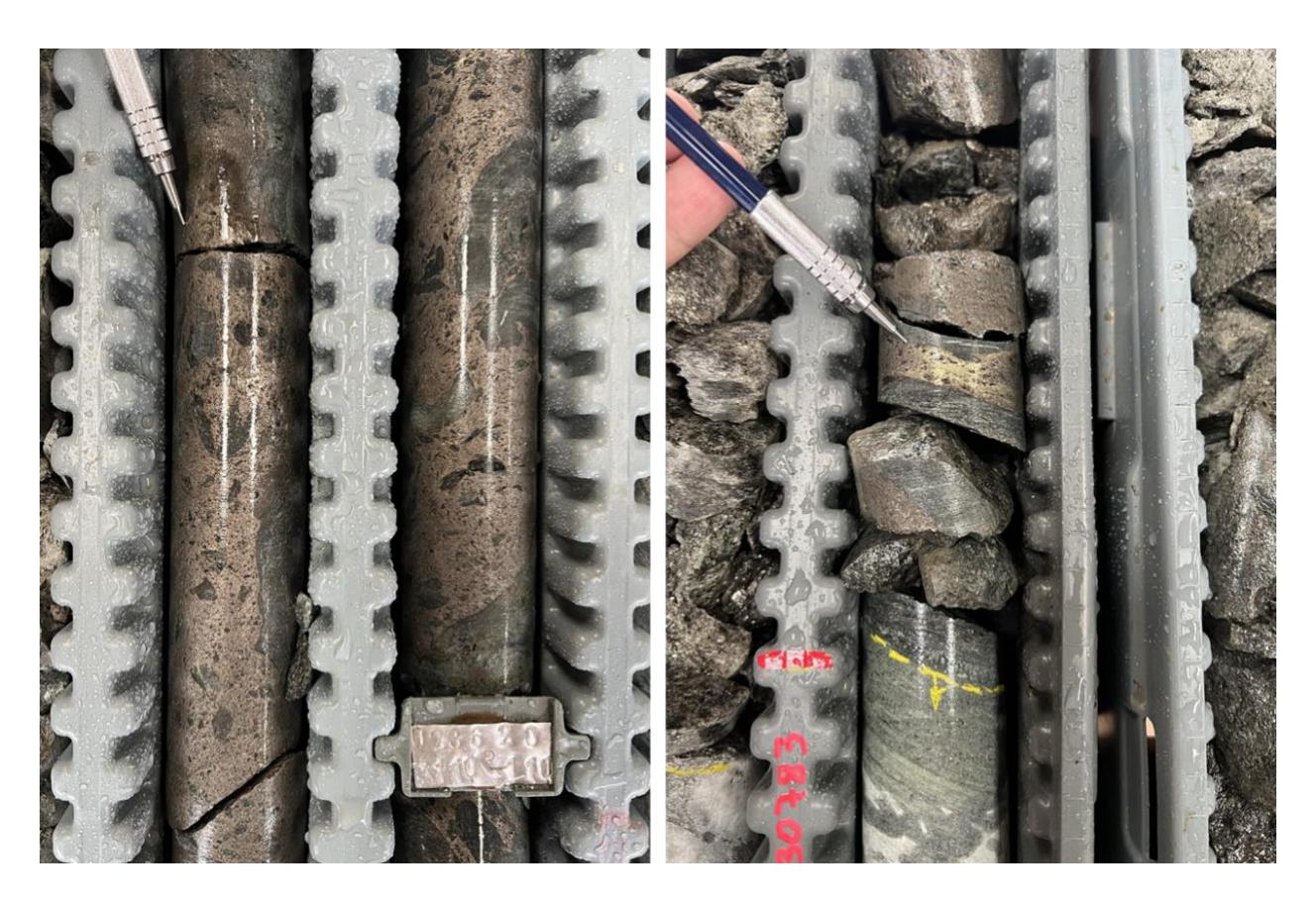
Figure 3: Semi-massive to brecciated sulfides intersected in DD23TU32, with nickel-sulfide grades up to 1.35% Ni, and copper up to 0.29% Cu. Dominant sulfide is pyrrhotite, with subordinate pentlandite and chalcopyrite.